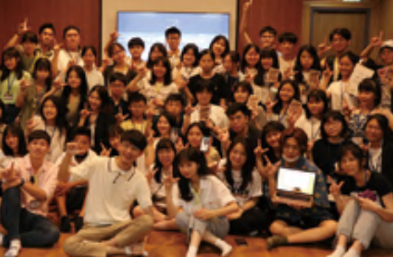
Taiwan Can - Sustainable Energy Creative Competition Lead For Taiwan - Promoting Critical Thinking