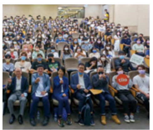
Impact Investment Campus Roadshow